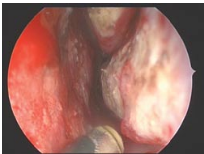
FIGURE 3. Endoscopic view of the left nasal cavity demonstrating the tip of the coblator wand as the surgeon is preparing to ablate a telangiectasia on the inferior turbinate. Note the areas previously cauterized on the inferior turbinate and head of the middle turbinate.

Septodermoplasty (SDP) was first described by Saunders in 1960. 54 This technique involves removal of the mucosa